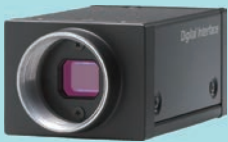
XCG-U100CR 2 Mega Raw Colour

Sony proudly introduces two new raw color GigE cameras to its popular XCG Series: the high-quality, high-performance XCG-5005CR and XCG-U100CR.