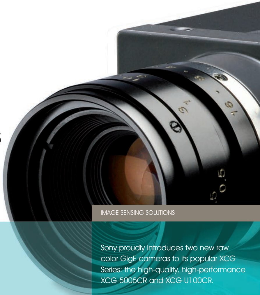
IMAGE SENSING SOLUTIONS

Sony proudly introduces two new raw color GigE cameras to its popular XCG Series: the high-quality, high-performance XCG-5005CR and XCG-U100CR.