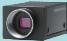
XCG-5005CR 5 Mega Raw Colour