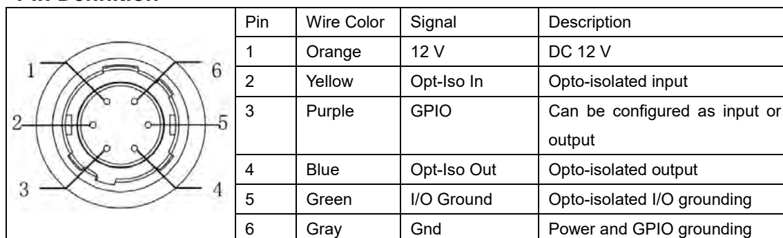
Table 1: Pin Definition